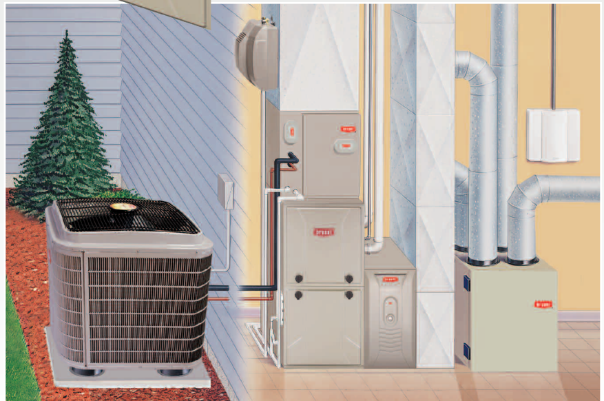
HYBRID HEAT® Deluxe Heat Pump and Deluxe Gas Furnace System